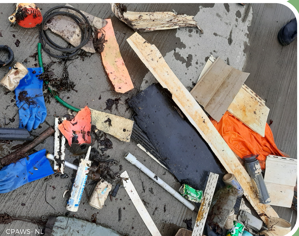
Marine debris recovered from the ocean floor around Hermitage Harbour