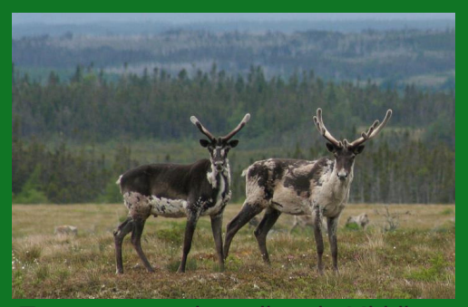
Two young male caribou in Middle Ridge, Wildlife Reserve, central NL.

We are so thankful to our team across the country and our incredible supporters who helped us in securing conservation wins and donating to our work. This award is for all of us!